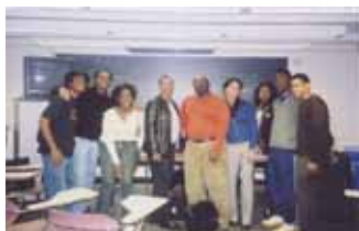
IPC Officers and Board of Governors present at end of their first meeting in Sept 2002.